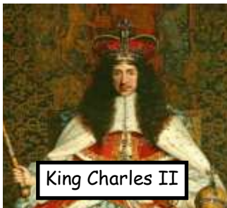
King Charles II

The Great Fire of London started in a bakery on Pudding Lane owned by Thomas Farriner. In 1666, the buildings in London were made of wood and straw and they were very close together which made it easy for the flames to spread. People used leather buckets and water squirts to try to put the fire out but these did not work. King Charles II ordered buildings to be pulled down to stop the flames from spreading. Samuel Pepys wrote a diary about what happened.