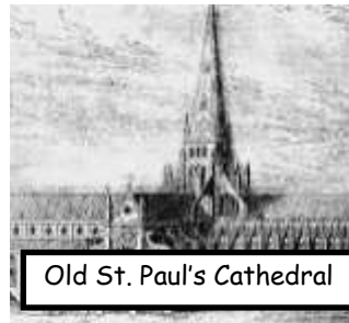
Old St. Paul's Cathedral